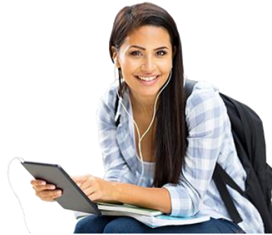
LiNK by Entourage Yearbooks